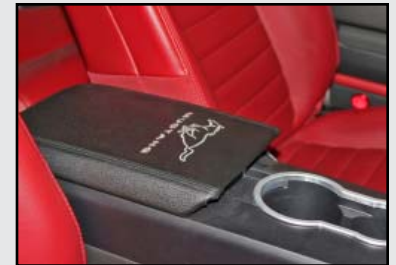
Mustang Running Horse Arm Rest Cover