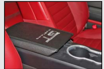
Mustang GT Arm Rest Cover